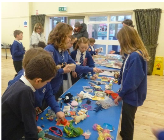
A photo from last year's Footprints Bring and Buy Sale where the school raised £126 for the charity.