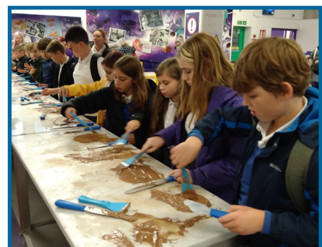
Fun in the chocolate factory...