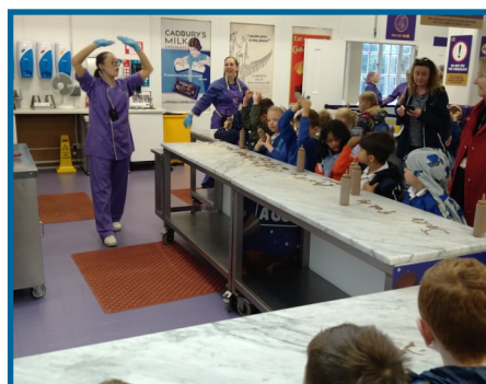
Writing names in chocolate...

On Tuesday 20th June, we had a brilliant time visiting Cadbury World linked to our 'Amazing Journeys' topic for this term. We found out about the journey 'From Bean to Bar' and the children really enjoyed themselves. We also toured the factory and had time to visit the shop to buy some treats. A big thank you must go to the PTA who funded the coach to enable us to keep the costs down.